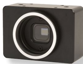
Compatible with C-mount lens adapter (sold separately)