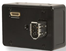
Easy access to IEEE-1394 and GPIO connectors