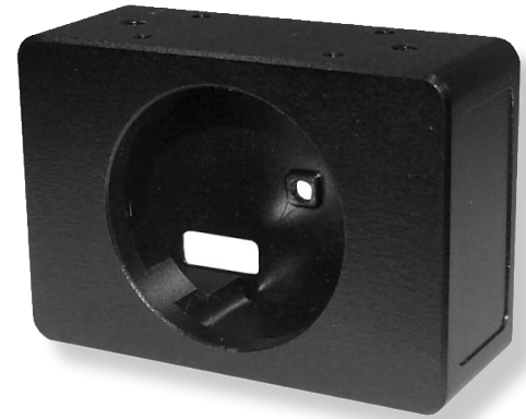
Firefly ® MV Aluminum Case (camera sold separately)

Multiple mounting options on the top and bottom of the case also allow easy integration into larger custom enclosures, while still providing complete access to the camera's status LED, general purpose input/output (GPIO) pins, and IEEE-1394 digital interface. A label cutout on the side of the case allows further customization for OEM's and system integrators.