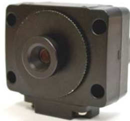
Figure 1: FFMV-03MT-CS with CS to M12 lens adapter