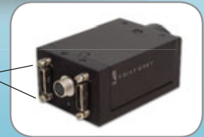
M2 screwholes for secure connection