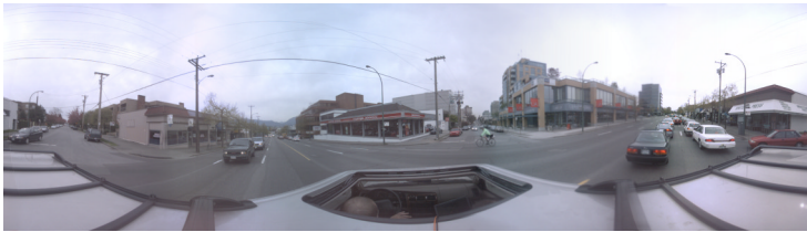
Image obtained by the horizontal cameras

The Ladybug™ is an omni-directional camera system for acquisition of high quality hemi-spherical video. The system has six cameras: five are configured in a horizontal ring and one is pointing vertically. The cameras are packed tightly together such that the distance between adjacent cameras is less than 20mm. This configuration enables the system to collect video from more than 75% of the full sphere with almost the same apparent point of view.