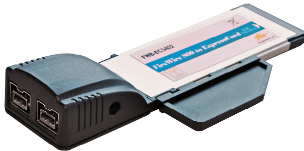
Figure 2: FWB-EC-2PORT ExpressCard with adapter attached